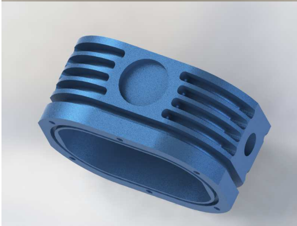
V2 pour usinage en majorité conventionnel